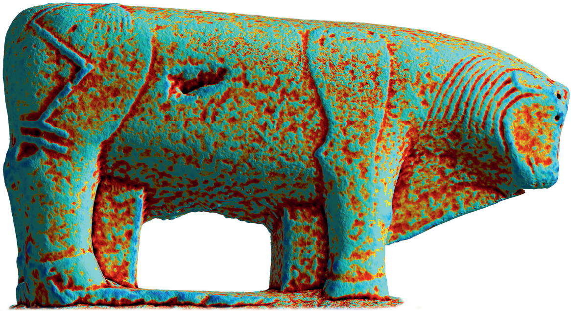
Figure 8: Bull 4.

In our opinion, the MRM also allows us to rule out (at least for these specimens) the hypothesis proposed by López Monteagudo according to which the strips on the backs of these animals could be interpreted as dorsuale , 63 specifically at the height of the front legs. This is a very interesting hypothesis, as it leads the author to date these sculptures to Roman times, since the use of the dorsuale did not spread in Rome until the 1st century BC. It is true that there are representations of processional bulls adorned with cloths on their backs in orientalizing ceramics in the south of the Iberian Peninsula (by the first half of the first millennium BC), 64 nor can it be ruled out that they were put on and taken off on these statues on commemorative or festive occasions, as noted by Blanco Freijeiro. 65 Nevertheless, the MRM technique has confirmed for our bulls the opinion expressed by Álvarez Sanchís that the supposed strips are nothing more than a means of highlighting the front legs (see Figure 8). 66