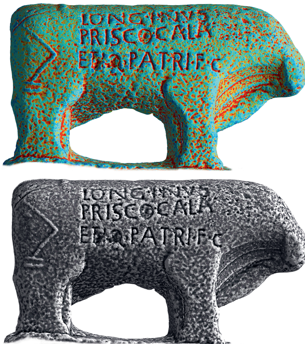
Figure 3: Bull 1.

Thanks to the MRM we can offer the optimum exemplum of the text of what we have called the second bull: