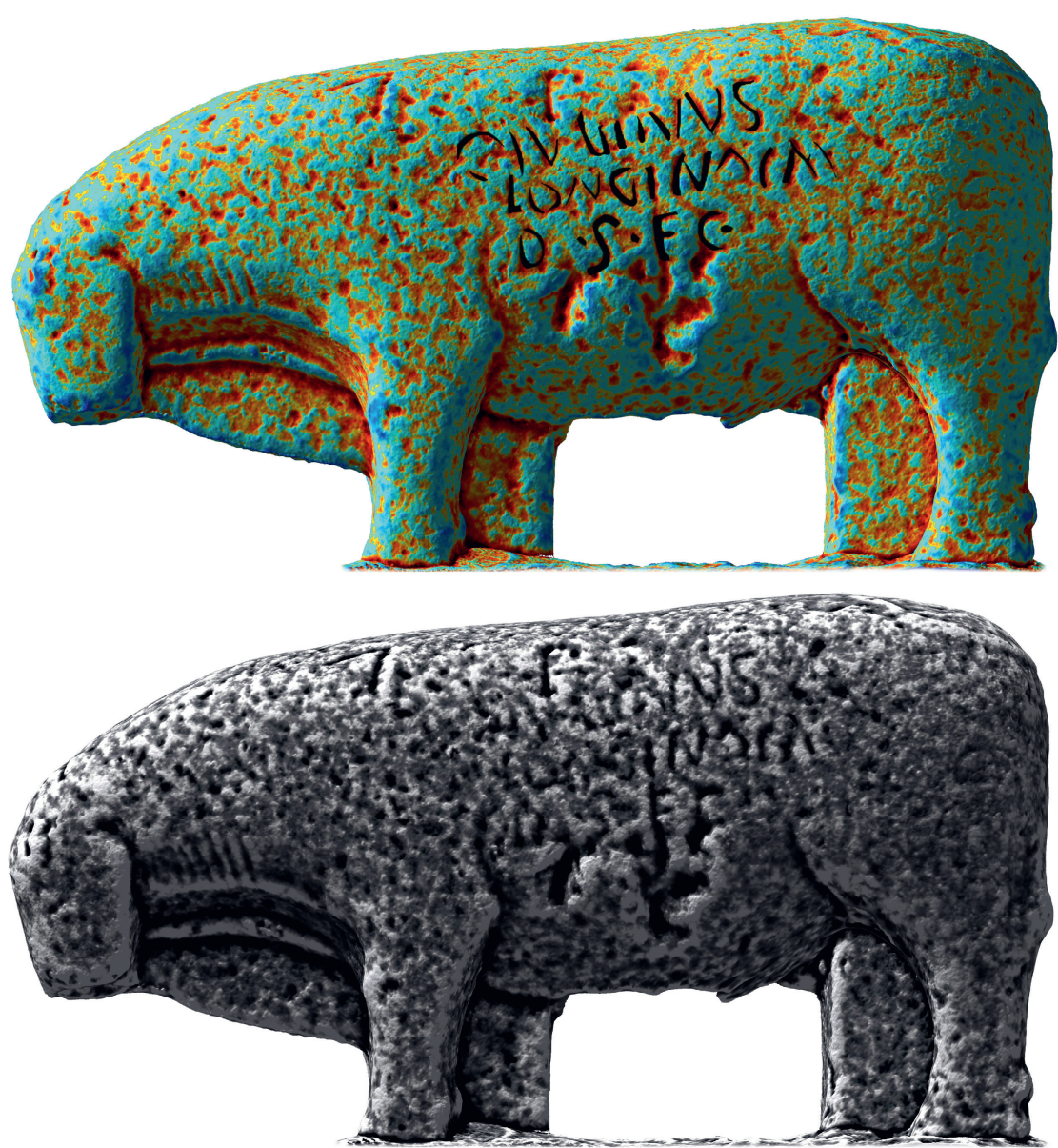
Figure 4: Bull 2.