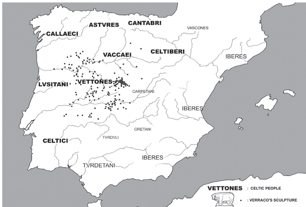
Figure 1: Pre-Roman peoples and 'verracos' in the Iberian Peninsula (after Berrocal-Rangel et al. 2018: 245).

de Guisando' testify precisely. 8 Whatever the case, the validity of their use as funerary monuments in Roman times, despite the passage of time and the popularisation of other models, only serves to underline the deep roots of this type of sculpture. 9