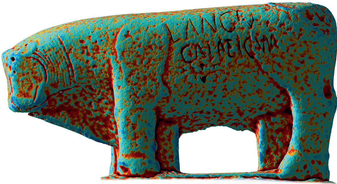
Figure 5: Bull 4 (MRM Image: Hugo Pires).

Following the MRM procedure, we can read: